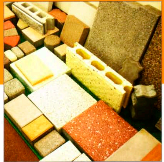
TIGER product versatility

TIGER innovative concrete masonry products used in environmentally sensitive fields are very popular. For example, articulated concrete masonry unit paving has emerged as a cost effective system used to prevent soil, riverbank and coastal erosion.